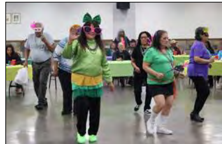
Elders participate in several line dances at the Elders Day celebration.