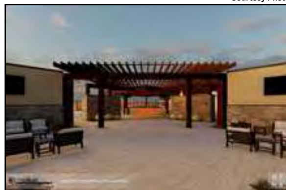
Digital images of how the Comanche Red River Hotel and Casino two pool additions will look when completed, which is estimated to be this summer.